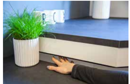
ROPOX SAFETY STRIP FOR TABLE TOPS

When a safety stop is activated in the system, the Smartbox to which the safety stop is connected will start flashing. Thus, it is easy to identify the activated safety stop and to solve the problem.