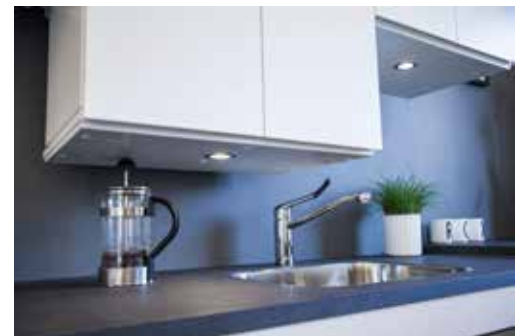
ROPOX SAFETY PLATE FOR UPPER CABINETS